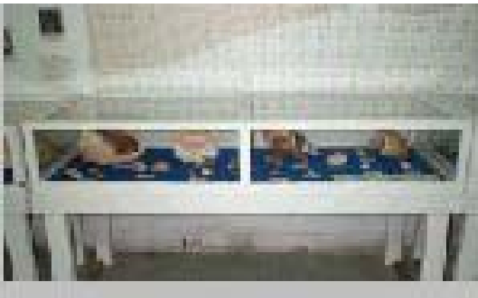
Gulf Of Mexico Shells