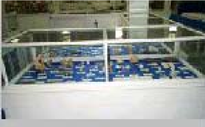
Common Texas Shells