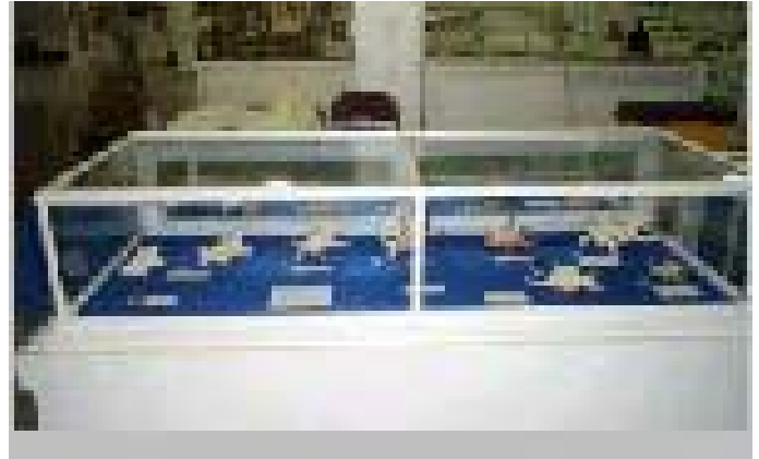
Spider Conch Growth Series